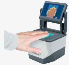
Ergonomic design and real-time user feedback